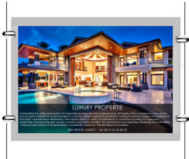
A3 Landscape Pockets

A4 Portrait LED Window Displays Plus A3 Landscape LED Displays