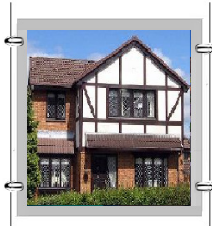
A4 Portrait Pockets