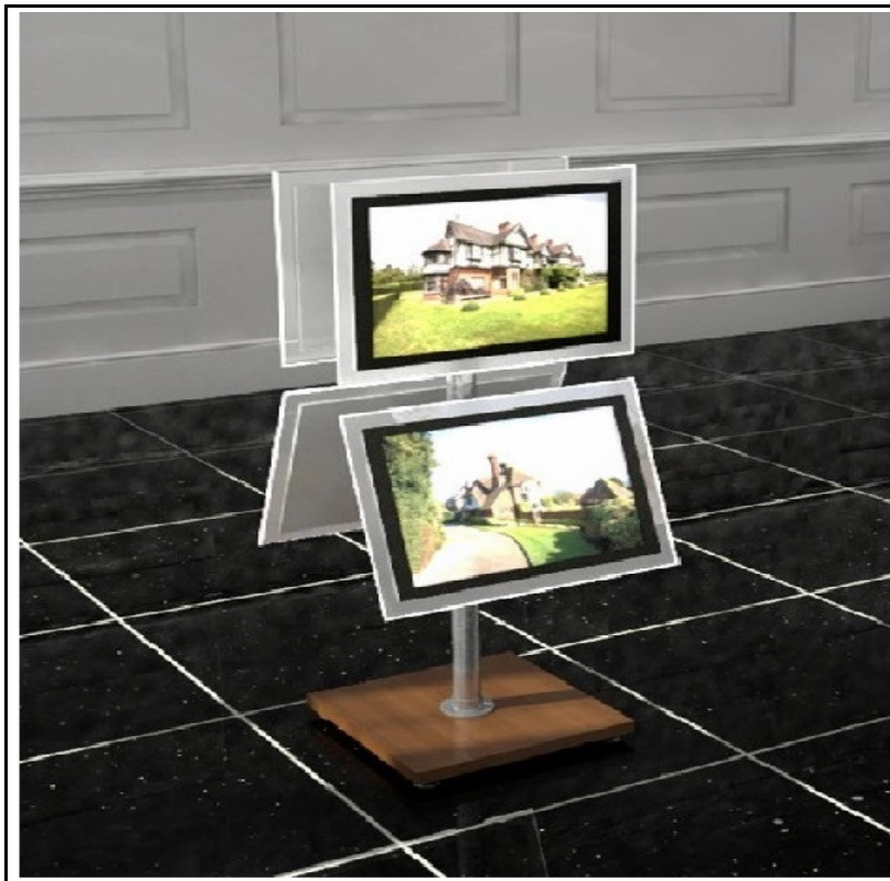
Front Profile - (Double-Sided)