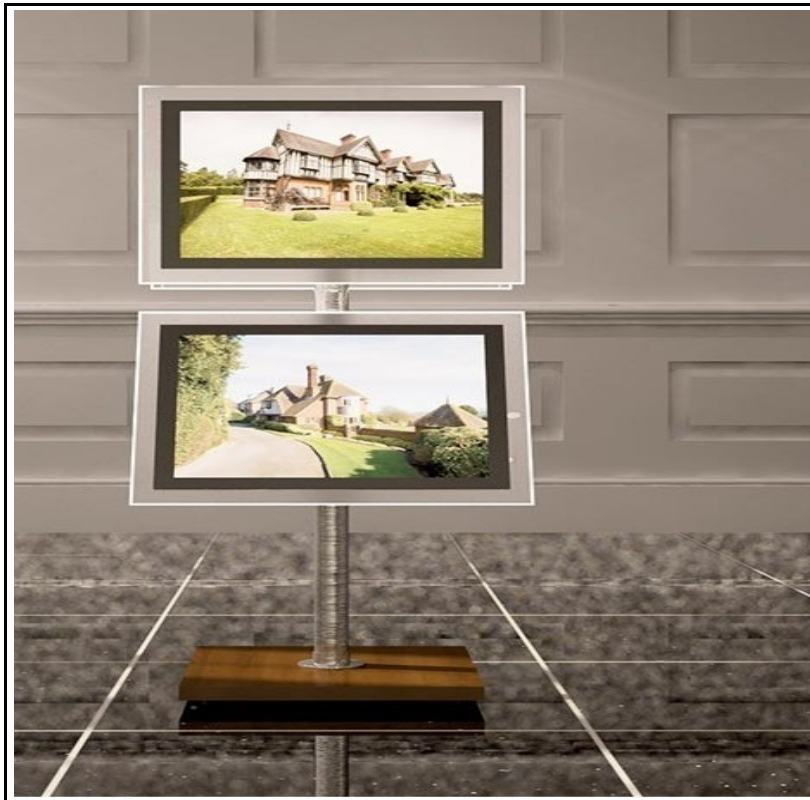
Front Profile - (Single-Sided)