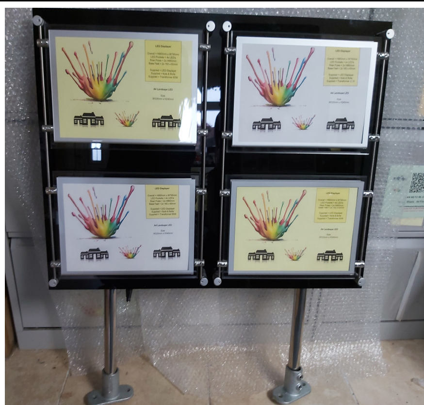
Image 1 - LED Panels - Front Image

Consists of = 4x A4 Landscape LED Panels Displays = 4x A4 Landscape Documents Easy Changes = Magnetic pull-down frames Solid Feet = Simple Bolt-to-the-floor-action