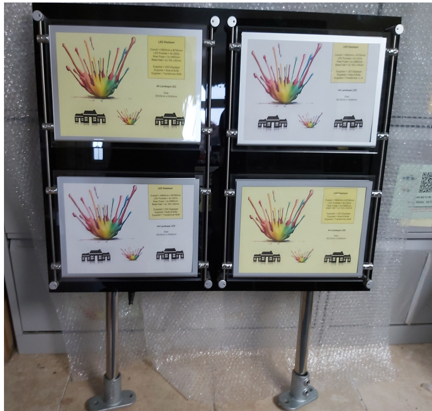
Image 3 - LED Panels - Front Image

Consists of = 3x A3 Landscape LED Panels Displays = 3x A3L - or 6x A4P Documents Easy Changes = Magnetic pull-down frames Solid Feet = Simple Bolt-to-the-floor-action