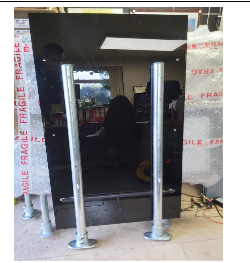
Consists of = 2x Galvanised Posts Consists of = 2x Galvanised Feet Consists of = 1x Plug-N-Play Power Connector Consists of = Simple Bolt-to-the-floor-action-feet