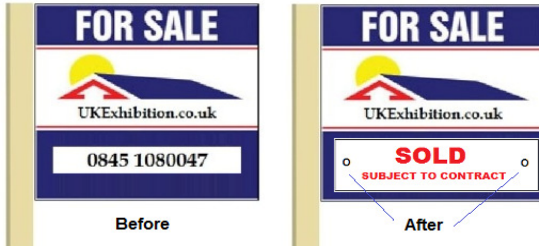
Standard "For Sale Sign"