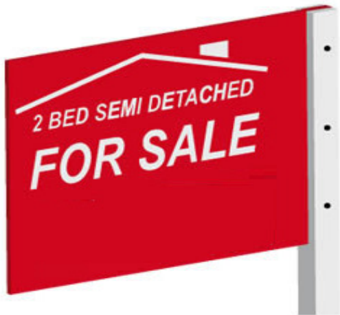
Flag Boards (Slotted Version)