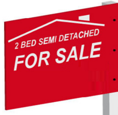
Flag-Boards - (Side Version)