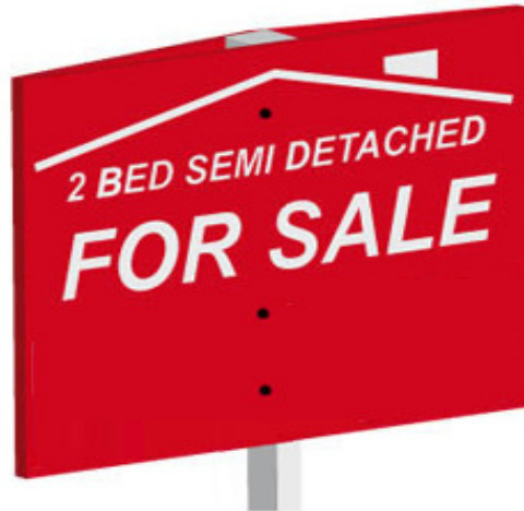
T-Boards - (Central Version)