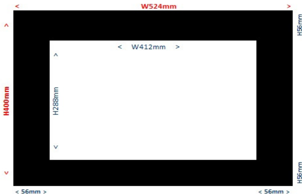
Image of looking down the frame - when connected to the LED Pocket